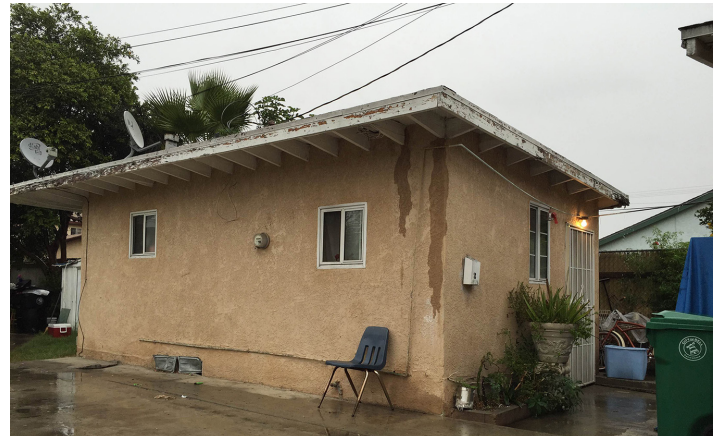
Figure 3. Unpermitted Back House in Lynwood.