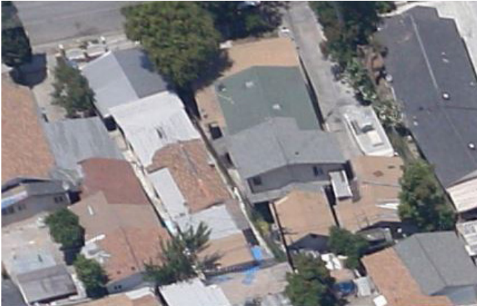
Figure 2. An Example of Unpermitted Housing Covering the Open Space on Residential Lots, Florence-Firestone.